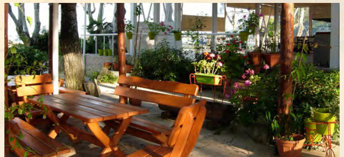
THALATTA KALAMITSI VILLAGE CAMP, GREECE